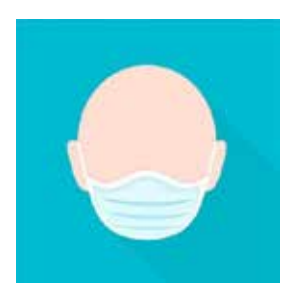
All visitors are required to wear a mask.

The Milford Bank's lobbies are now available for service without an appointment. For the safety of our employees and our communities, please adhere to these guidelines: