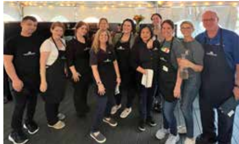
■ TIP-A-TELLER NIGHT TO BENEFIT FOOD 2 KIDS