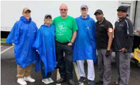
■ SHRED & RECYCLE DAYS