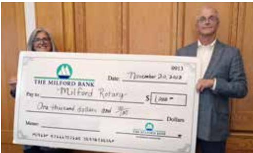
■ DONATION TO MILFORD ROTARY