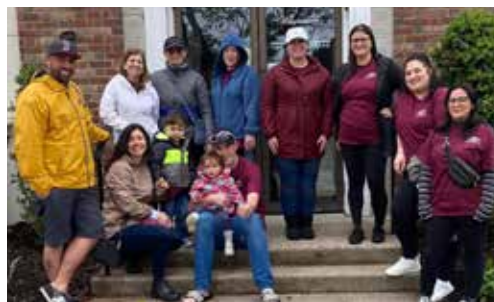
■ WALK A MILE IN HER SHOES

A s Milford's only hometown bank, we take a very active role in our community. This includes event sponsorships, charitable contributions, and more!