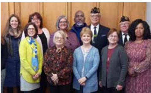
■ TMB FOUNDATION GRANTS