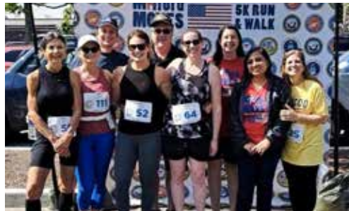
■ MILFORD MOVES 5K